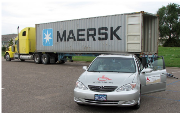
In 2008 IORO shipped this container full of donated items to the wonderful isolated disabled people of Liberia.

IORO is pleased to announce a new partnership with POF to help restore mobility to children and adult amputees in Liberia, West Africa. Please visit: www.pofsea.org