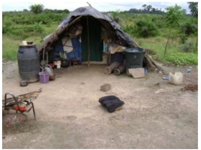
Most of the isolated disabled children in Liberia live with their families in huts like this one.