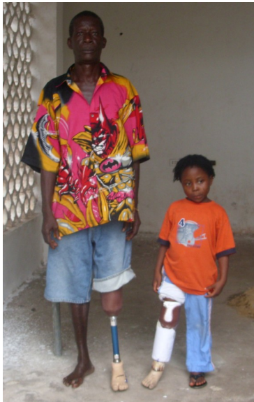
Our donors helped these people walk again by providing materials and financial support to fabricate their prosthetic legs.